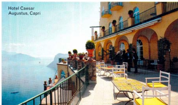
Hotel Caesar Augustus, Capri

► If your kids think that history is boring, give them a more interesting lesson in the infinity pool at the Hotel Caesar Augustus on the island of Capri, Italy. Perched on the edge of a 1,000-foot cliff, it has a magnificent view of the Mediterranean — a jaw-dropping panorama across the sparkling Bay of Naples. Capri was where the ancient Romans chose to spend their vacations, and on a clear day you can see Vesuvius, the volcano that buried Pompeii in A.D. 79. At the hotel, a statue of Augustus himself recalls the first emperor who admired Capri's beauty so much that